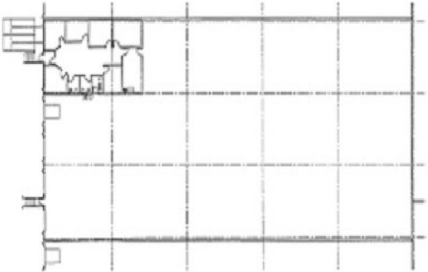
Floor Plan Scale 1" = 20' August 17, 2012

HAMILTON PARTNERS www.hamiltonpartners.com